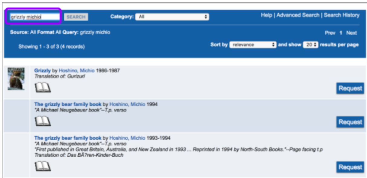
Figure 6: Simple search results

The Search box at the top of the DueNorth home page is also called Simple Search. It allows for keyword searching. You can combine terms from a title and author. A common title such as Tale of Two Cities or the terms “Dickens tale” will return a large number of hits. Following is an example of a simple search that returned a small number of hits. This search was for the title The grizzly bear family book by Michio Hoshino. The words ‘grizzly’ and ‘michio’ were entered.