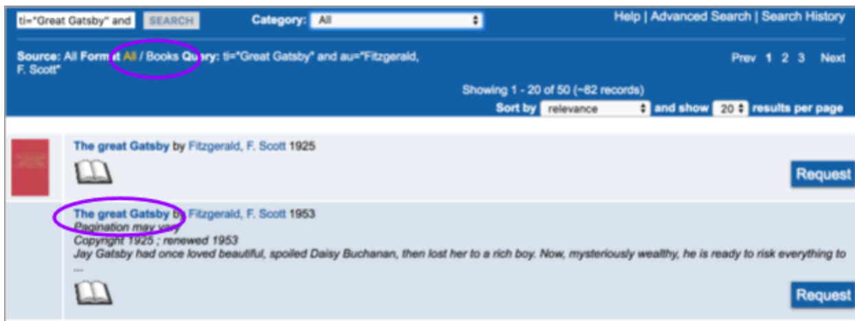
Figure 10: Limited results display

Click on the title to display the holding libraries.