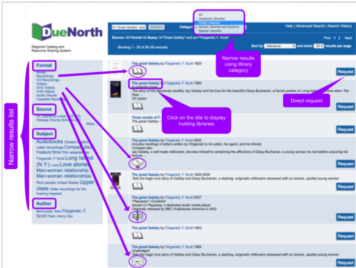
Figure 9: Results display

The format Books was selected to narrow the search below. In the Search box, the word All is now highlighted in an amber color. Click on All to undo the narrowing selection and return to the previous screen.